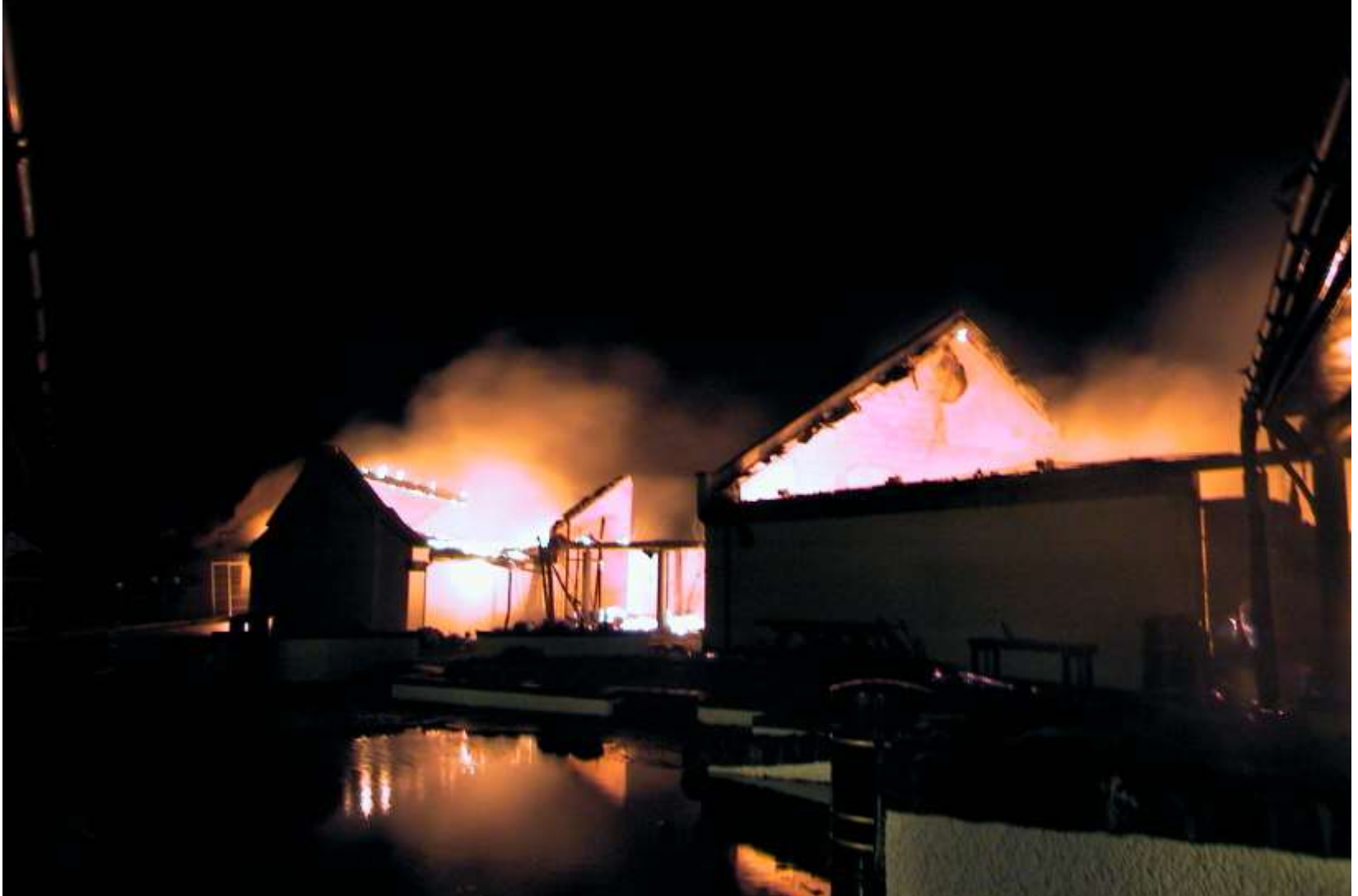
Photo taken at 3.00am