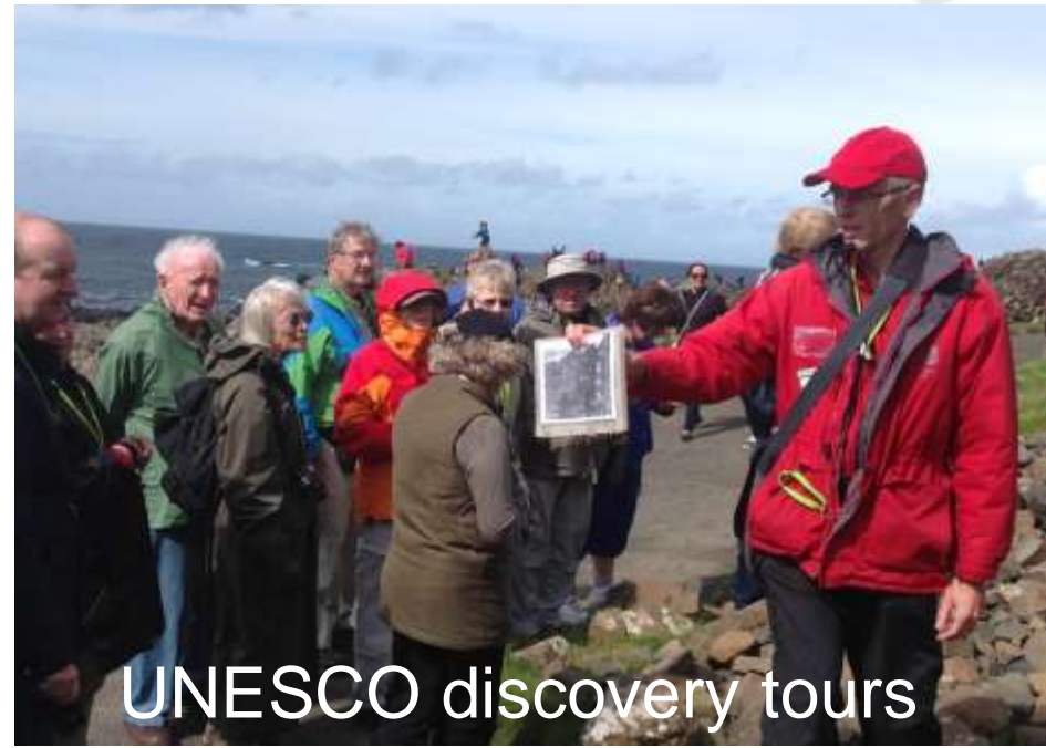
UNESCO discovery tours