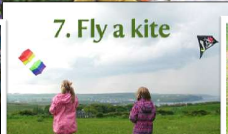
7. Fly a kite