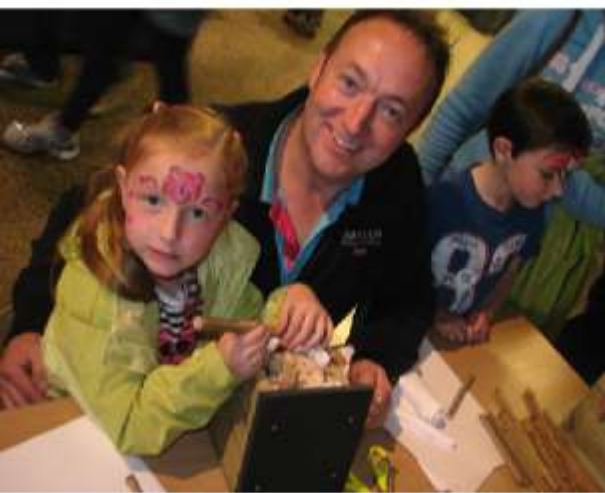
Building Bee Boxes