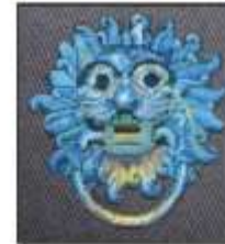
Durham Cathedral Sanctuary Door Knocker by Pippa Foulds