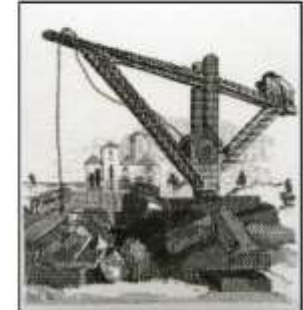
North East Pit Head by Sally Bird