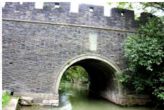
Fengshan Water Gate