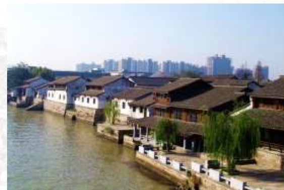
Qiaoxi Conservation Area