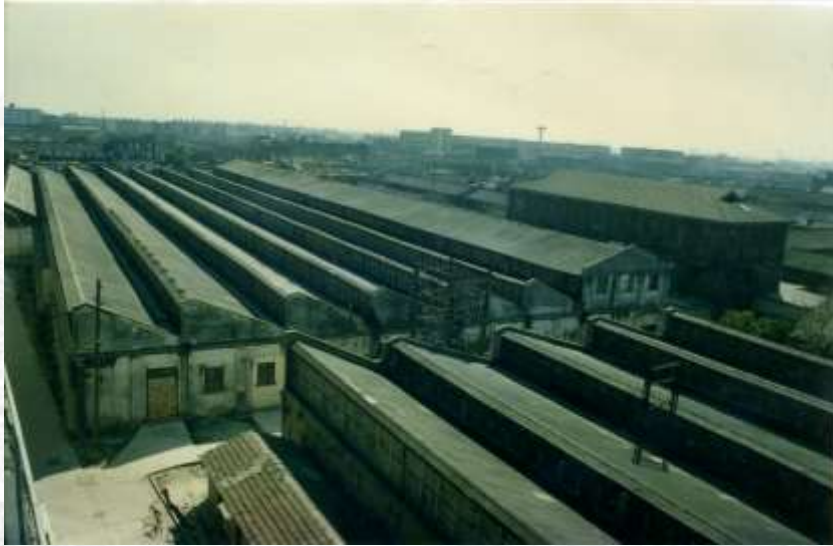
Old factory building