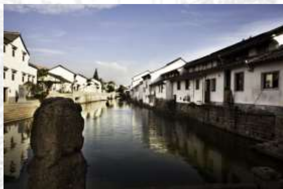
Dock at Xixing Distribution Center