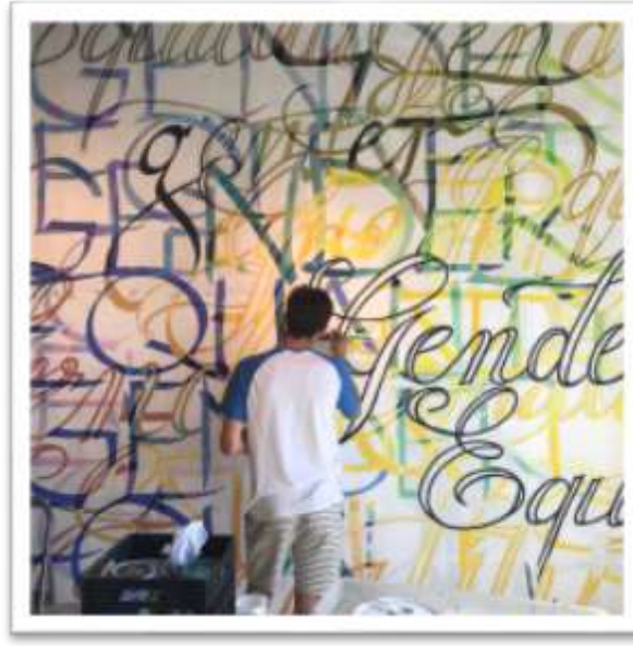
World Heritage City Day