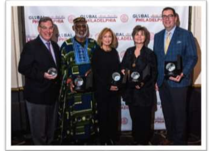
World Heritage City Day