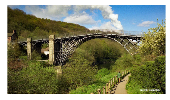
World Heritage Site Coordinator sought for Ironbridge Gorge

A great cast of speakers awaits you at the latest of World Heritage UK's Wednesday webinars, with a